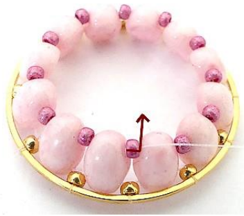
8) Here is the result 😊 Exit through the SB11