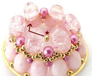
14) Insert 1 SB15 between the Samos