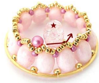
12) Insert 1 Samos (C2) through the central SB15. Repeat steps 11 and 12 throughout the lap