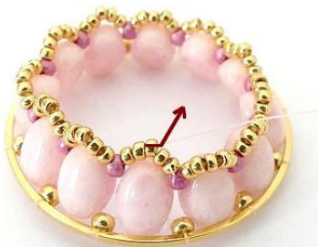
10) Here is the result 😊 Exit through the central SB15