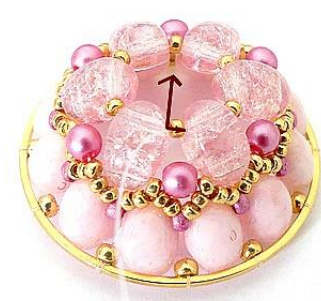
15) Here is the result 😊 Exit through the SB15