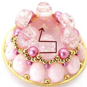
13) Here is the result 😊 Exit through the top hole of the Samos