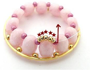
9) Insert 5 SB15 between each SB11. All the way around