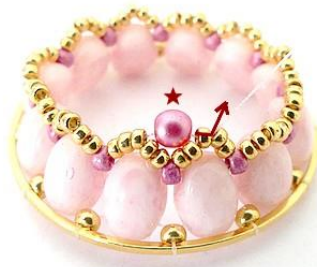
11) Insert 1 RP3 through the next central SB15