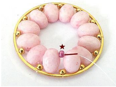
7) Insert 1 SB11 (C2) between each Samos